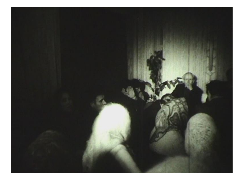
Figure 1. A still from a Soviet anti-religious documentary film 'Return to the Truth' (Moldova Film, 1985) showing KGB officers entering an illegal place of worship and shining a light into the faces of startled believers.

organisation' recalls Soviet-era raids, arrests and deportations of Witnesses 60 years earlier. Mirroring the way that anti-religious operations were carried out from the 1950s-80s, the state security agencies ensured that visual evidence was gathered both for use in criminal prosecutions as well as for consumption on news and social media platforms.