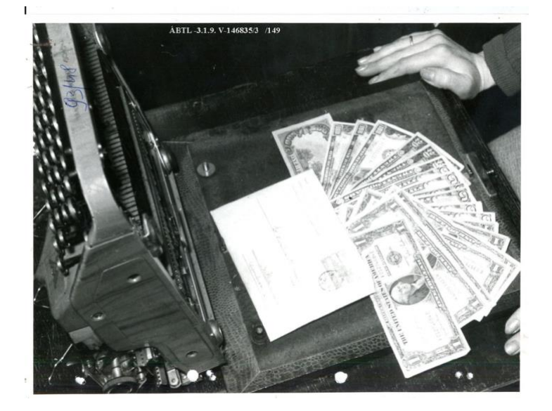
Figure 4. Typewriter with US Dollars hidden inside discovered during a house search of a Hungarian Cistercian monk in 1961 (ÁBTL 3.1.9. V-146835/3) See Kinga Povedák, 'Evidence of illegal activity of underground Catholic religious order Hungary',

http://hiddengalleries.eu/digitalarchive/s/en/item/4