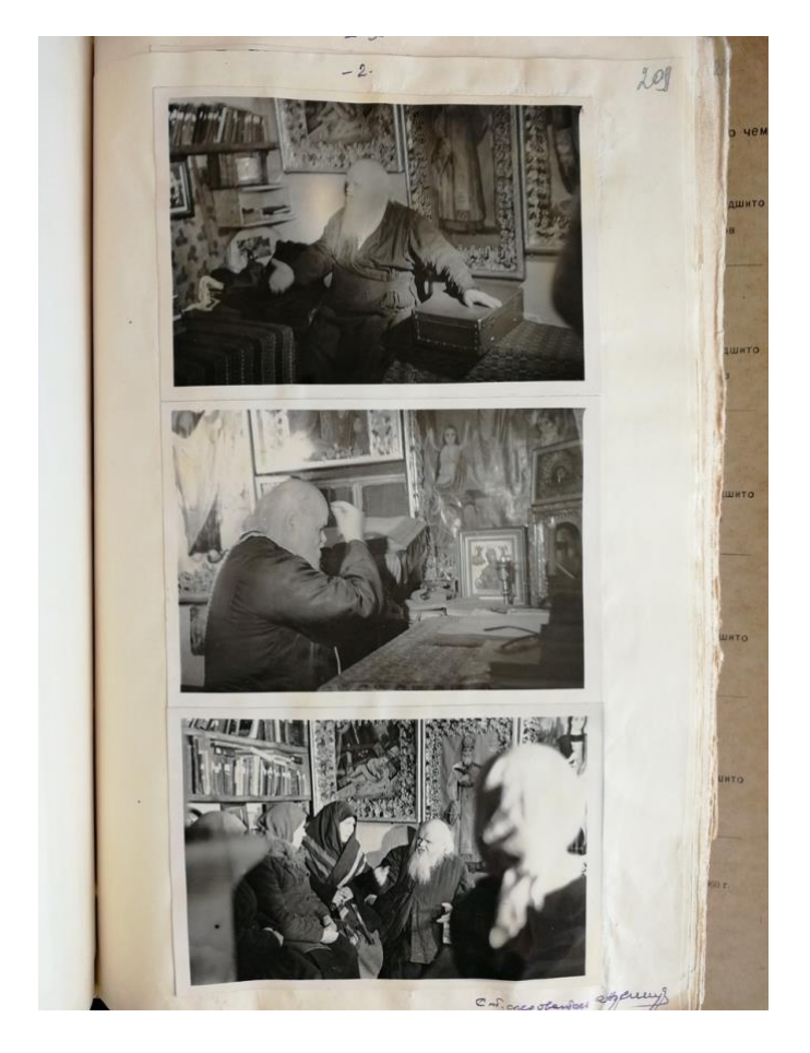
Figure 11. Still photographs of Father Mitrofan with his followers in his KGB case file. The images are stills from the film The End of Spider. See Tatiana Vagramenko, Secret Police Photographs of Ionnite Community, Ukraine', <u>http://hiddengalleries.eu/digitalarchive/s/en/item/161</u>

The audience effectiveness or the power to change attitudes of such films is difficult to assert or gather empirical evidence about (Roberts, 1999, 5). Soviet ideologists, including Lenin himself, drew a distinction between propaganda, which was comprised of many ideas presented to one or a few viewers and agitatsiia , which was designed to present one or a few ideas to a wide, mass audience (Roberts, 1999, 15). Films such as Apostles without Masks and The End of Spider clearly fitted this second category – they are simple and direct and, at least in part scripted by the KGB and their case files. As Roberts explains (1999, 140), ordinary Soviet citizens would be exposed to this kind of newsreel short film far more than the art or fiction films for which early Soviet cinema is famous in the West. Cultural hegemony and agenda setting could certainly be achieved far more readily through the newsreel-style propaganda film (Roberts, 1999, 149).