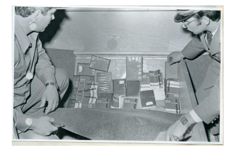
Figure 5. Romanian border guards uncover bibles and religious materials hidden under the floor of a camper van in 1985 (ACNSAS D000003, vol. 1) See Iuliana Cindrea-Nagy, 'Photographs of confiscated religious materials smuggled into Romania', <u>http://hiddengalleries.eu/digitalarchive/s/en/item/215</u>

http://hiddengalleries.eu/digitalarchive/s/en/item/4