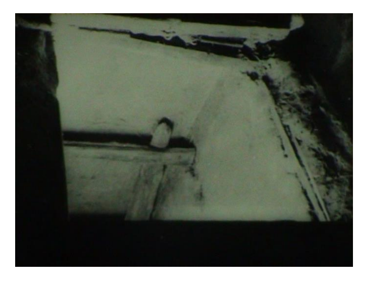
Figure 10. Still from the 1959 Moldova Film production Apostles without Masks showing the entrance to an Inochentist hideout. This image, along with several others in the film, is taken from KGB file ASISRM-KGB 023262 © Archive of the Service for Information and Security of the Republic of Moldova, former KGB.

to 'consolidate Soviet values', the propagandists, journalist and filmmakers, who were enjoying relative freedom of expression in this period (Shaw, 2002, 9; see also Woll, 1999), produced a powerful dichotomy between the 'decent', 'rational' and 'disciplined' citizen and the 'depraved', 'hysterical', 'irrational' and 'savage' sectarian (Dobson, 2014, 241). The contrast between darkness and light seen on screen is illustrated throughout with materials sourced from the same secret police case file as those used in the print publications of the time (see figure 10).